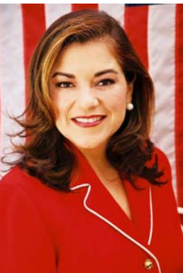
Representative Loretta Sanchez (D-CA), District 47.

The NFIRE spacecraft originally was designed to feature an additional sensor that would have flown near a missile target during testing to take a closer look. The additional sensor was to be mounted on a kill vehicle developed for missile interceptors.