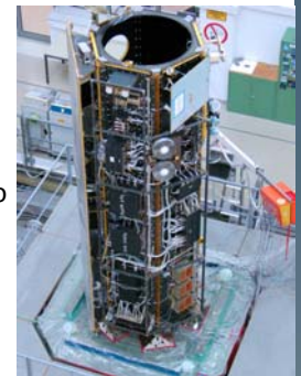
TerraSAR-X during shock and vibration tests.

That has not been possible until now, as the bandwidth of radio waves is not large enough. Another advantage of this new form of communication is that lasers are easier to focus than radio waves, which means that data transmissions can be directed more accurately. 5