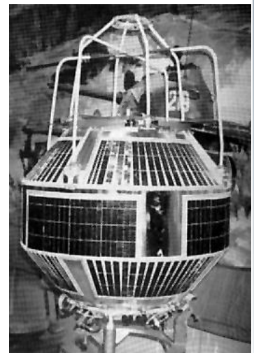
A Strela 1 store-and-forward communications satellite. Cosmos 2251 had a similar appearance.

The 900-kilogram (1,980-pound) Cosmos 2251 was a Strela 2M military store-and-forward communications platform launched on June 16, 1993 from Plesetsk, Russia aboard a Kosmos 3M launch vehicle. Typically, Strela 2 series satellites have a service life of five years, and Cosmos 2251 was inactive at the time it collided with Iridium 33. Strela 2M uses the same KAUR-1 satellite bus as that of the Strela 1 series, pictured at right. Strela-2M satellites were launched one at a time into orbits of 800 kilometers (497 miles) altitude in three orbital planes inclined 74 degrees to the equator, each unit spaced 120 degrees apart. The satellites are built by Reshetnev and operated by the Russian Ministry of Defense. 4